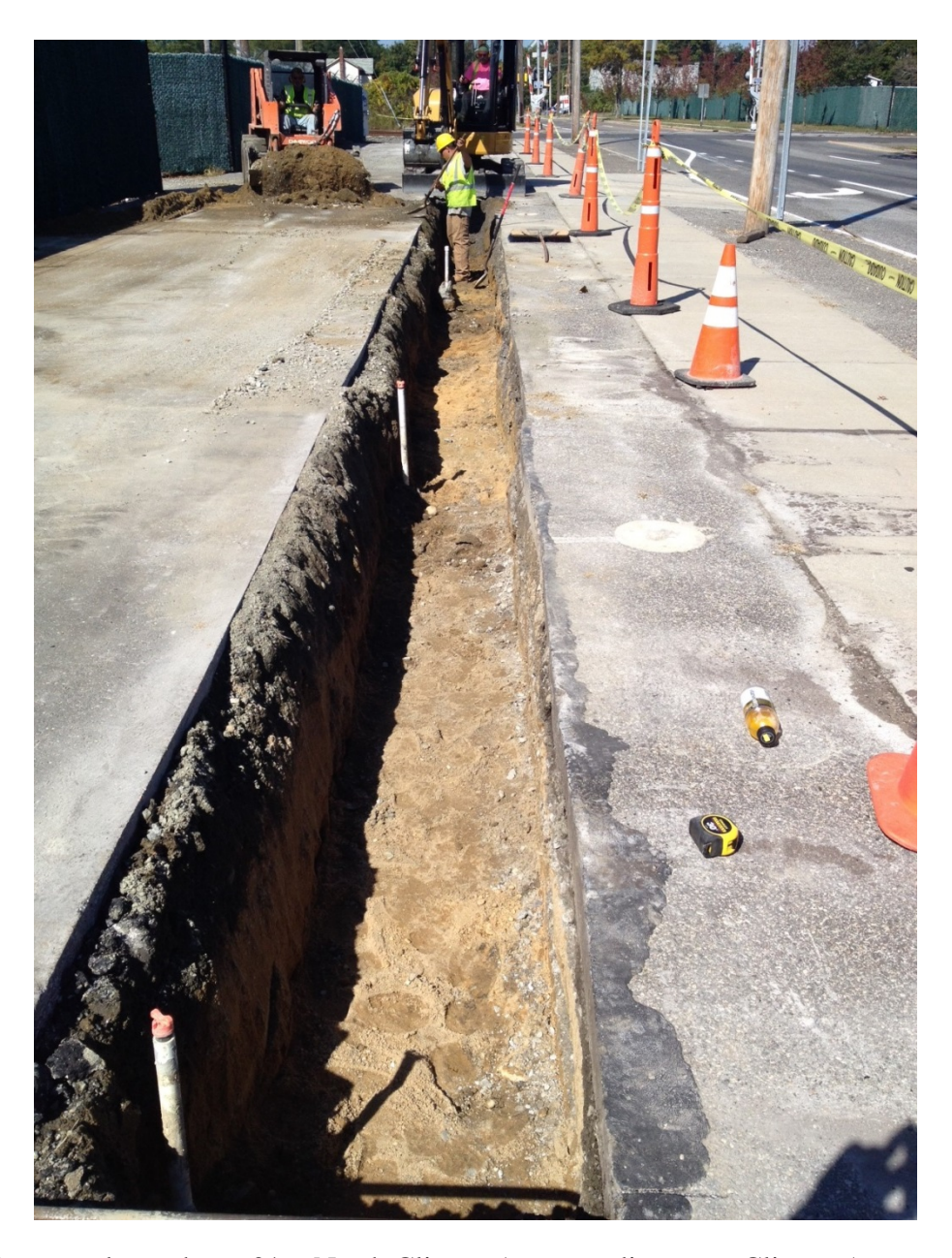
Excavated trench at 60/66 North Clinton Avenue adjacent to Clinton Avenue