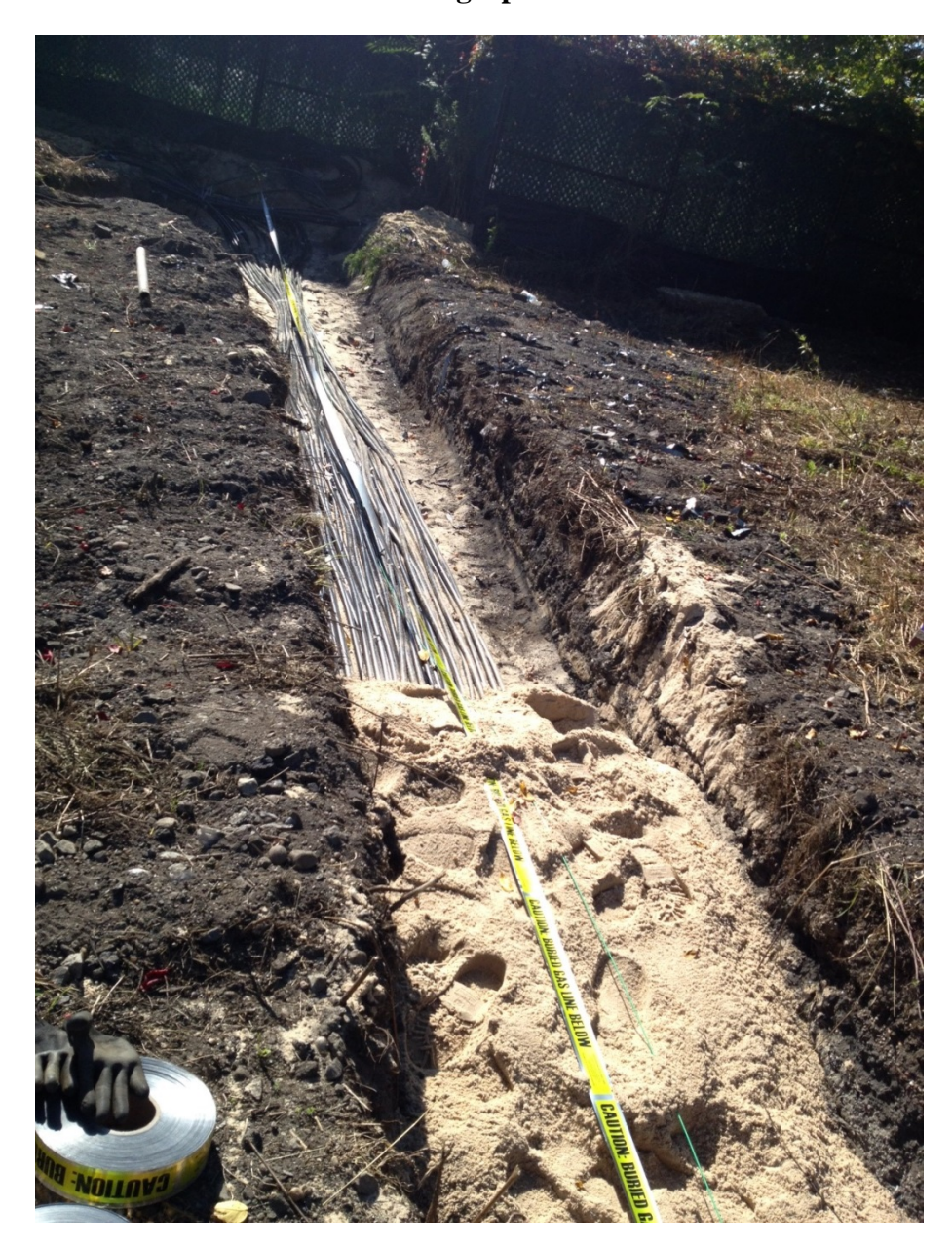
Oxygen supply lines and backfilling at 60/66 North Clinton Avenue